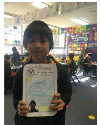
Shio likes to go to the beach!