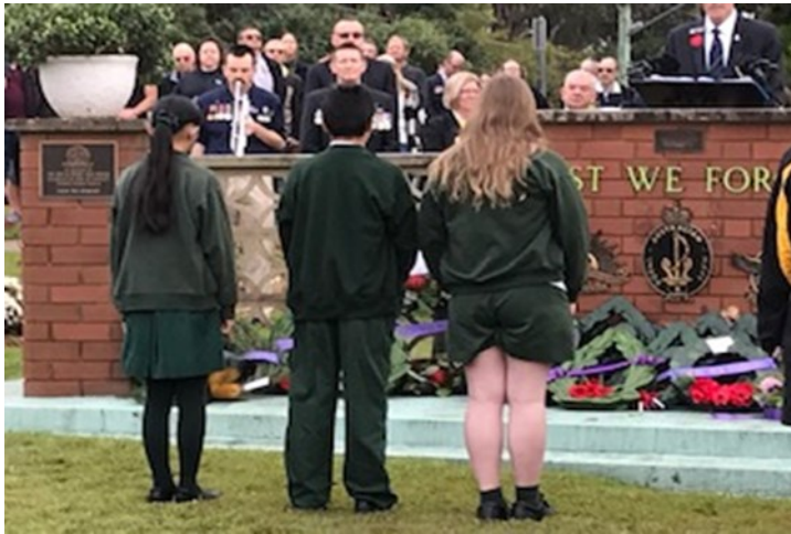
Laying the Wreath