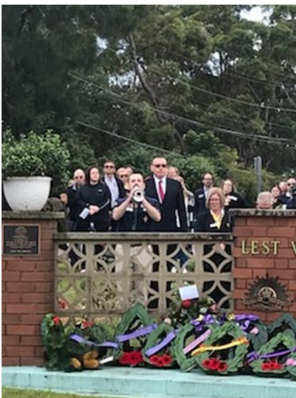
The Last Post