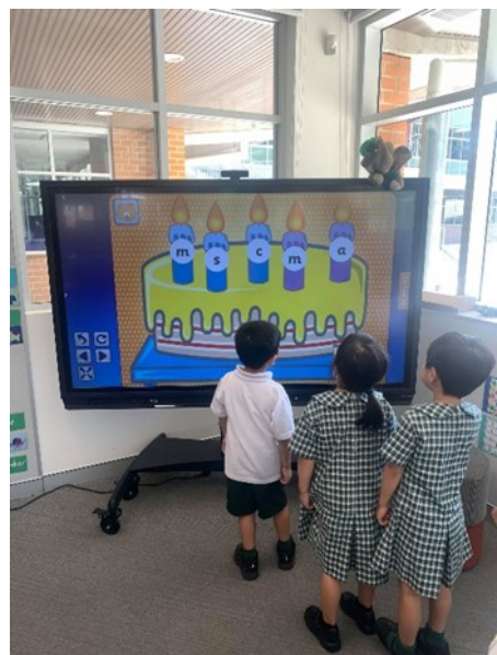
Playing Phonic Hero to learn some of our sounds.