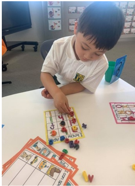
Matching letters of the alphabet.