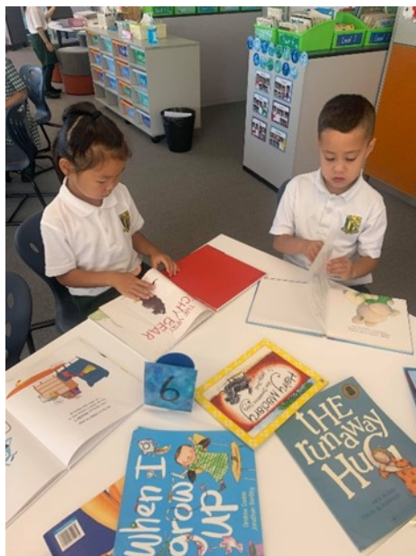
Looking at books and making sure we turn the pages nice and gently.