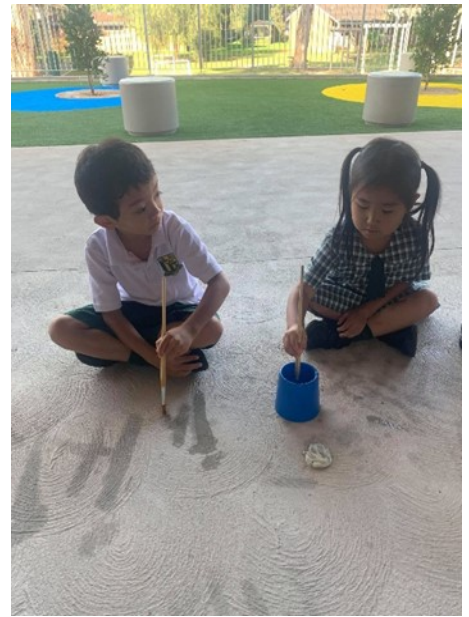
Using paint brushes and water to write our spelling words.