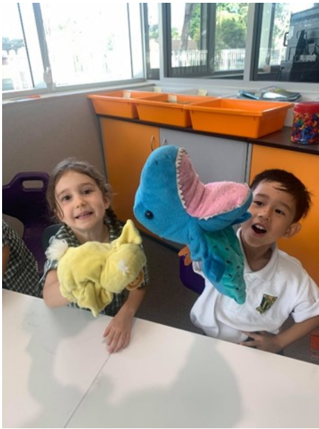
Using puppets to tell our friends about our weekends.