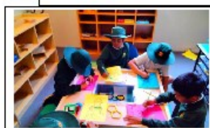
Art and craft: creativity & imagination