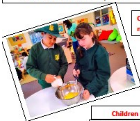
Our little master chefs