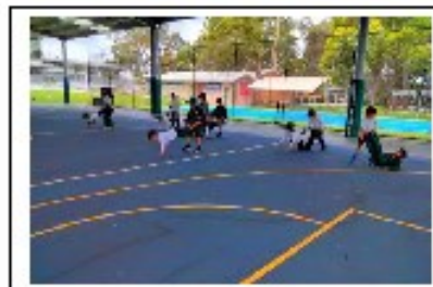
Sports day: crab race and wheel barrow race